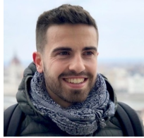
Benjamin Cuer Statistics